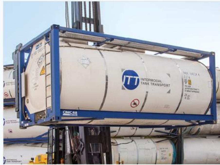
20' ISO TANK