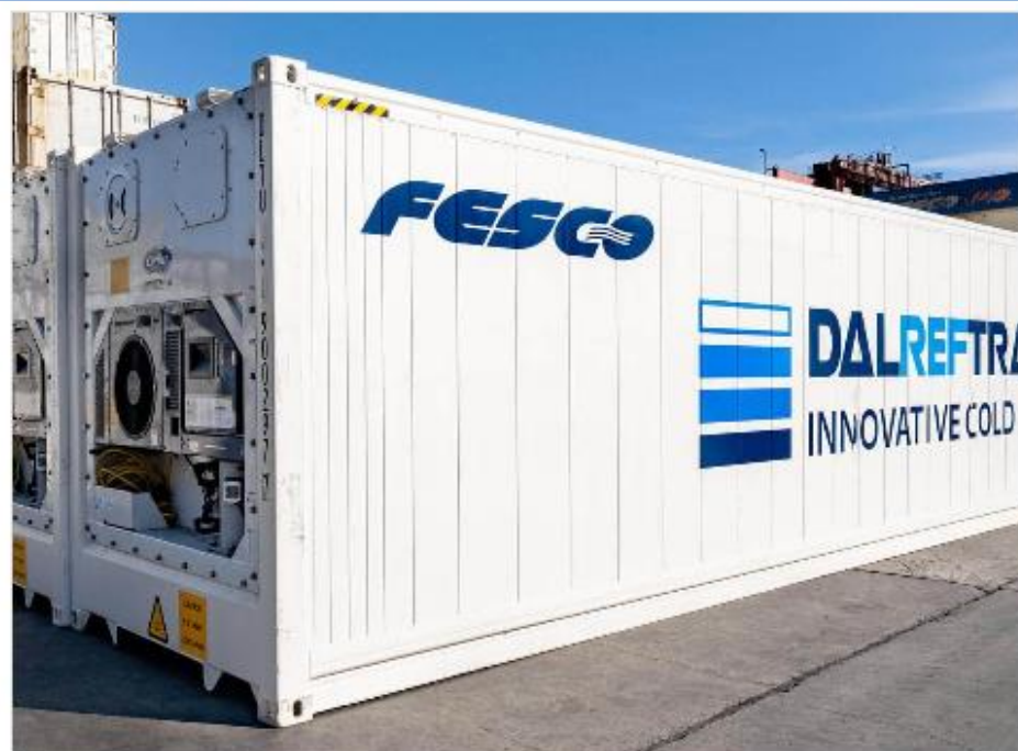
40'RF (REEFER CONTAINER)