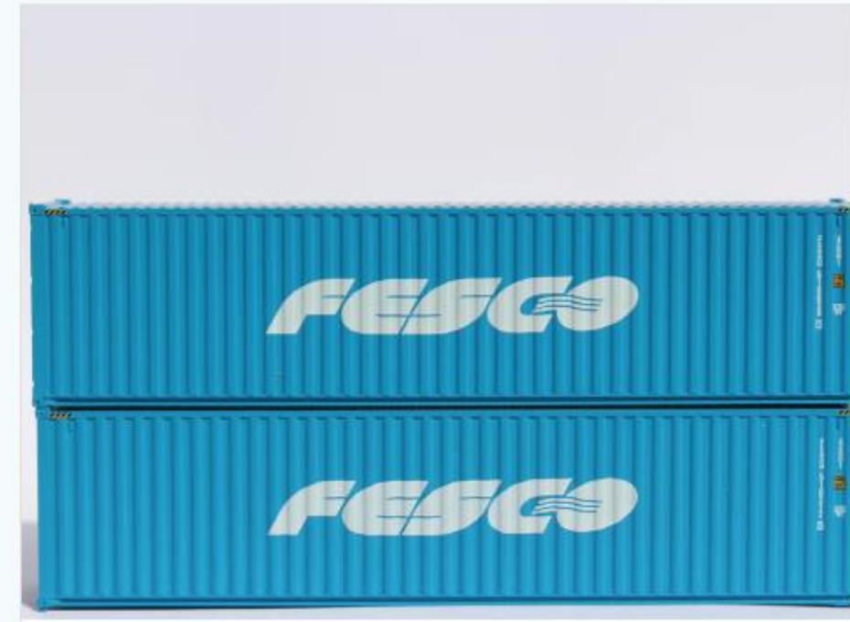
CONTAINER 40' HIGH CUBE