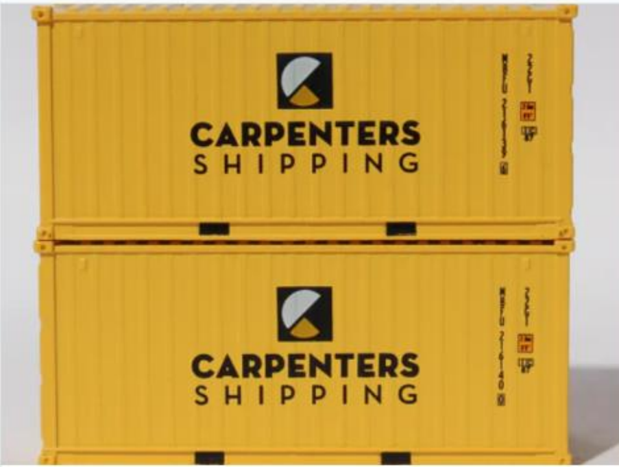
20'DC (DRY CONTAINER)